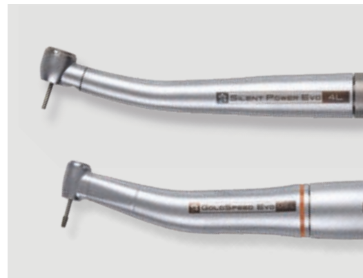
Turbines and contra-angles Six silent yet powerful models of highly advanced turbine, plus a broad range of ergonomic contra-angles that meet all clinical needs, from conservative dentistry to implant surgery and endodontics. With the instrument (turbine, micromotor) extracted, the LED ring shows the activated spray mode.