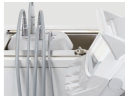
I.W.F.C. This device performs automatic spray circuit flushing; perfect between one patient and the next or if the machine has been idle for a while.