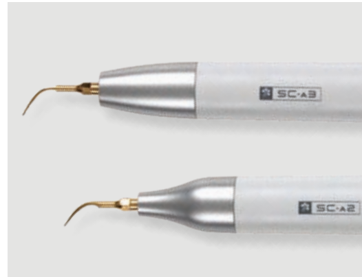
SC Scalers Ultrasound scalers suitable for supragingival prophylaxis and periodontal tasks. Also suitable for the preparation of small cavities and usable in endodontic root canal cleaning techniques. The LED ring indicates the current scaler mode: PARO – green; ENDO – orange; NORMAL – blue.

Identification Technique). This highlights the presence of composite materials thanks to the fluorescence emitted by a special LED integrated in the instrument. Moreover, thanks to its broad emission spectrum, the new curing light is optimized for latest-generation composite materials.