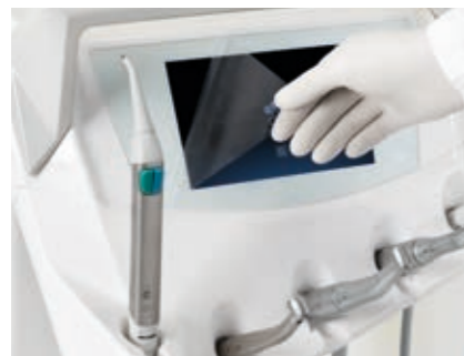
Cleaning the display The control panel can be disabled to sanitize the glass surface of the display, thus preventing unwanted activation of controls. Moreover, disposable covers are provided.