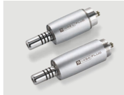
FLUO micromotors (i-XS4 and i-XR3L) Even lighter and quieter, these micromotors are now available with FIT technology to detect composite materials. They allow faster, more precise removal of old composite in teeth that need to be retreated. With orthodontic or aesthetic treatments, bracket removal is simple, safe and effective.