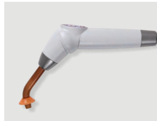
T-LED Instrument with 180° ergonomic rotation. Features 6 polymerisation and bonding programmes with immediate or gradual start. Does not cause composite shrinkage.